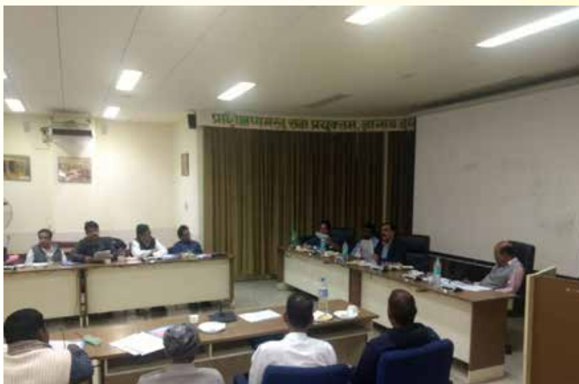
Group Meeting at BCCL on 15 December 2017

‘Industries Meet’ programme organized by BOPT(ER) Kolkata is a very important event all throughout the year. The basic objective of such meet is to harp on the issues related to apprenticeship training, maintenance of records & returns of such training as well as to monitor the quality of the training. These meets are required to understand the difficulties faced by the industries and the students and to further improve the training seats as well as the quality of training.