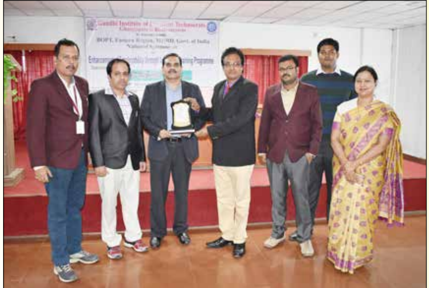
Director BOPT(ER) along with the participants in the group meeting on internship at Bhubneswar