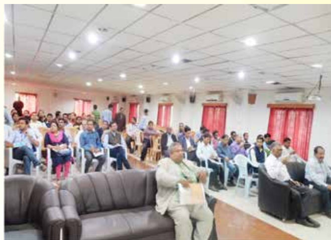
Enhancement of Employability through Internship Training Programme on 20 December 2017 at Gandhi Institute for Technological Advancement, Bhubaneswar

It has often been a challenge to BOPT(ER) Kolkata to increase the training slots for the apprentices as well as motivate the pass out students to join for apprenticeship training. To this aim, lots of visits are undertaken by the officers of BOPT(ER) Kolkata to locate newer industries for more training slots in the Eastern Region. During these visits, the manpower strength and the infrastructure of the establishments/industries are also reviewed to assess the training scope as available. A special emphasis has been put on the states in the North-Eastern Region which deserved a major drive to facilitate the benefits of National Apprenticeship Training Scheme.