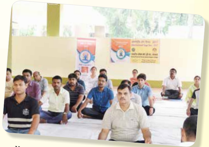
Yoga Day celebration in the premises of BOPT(ER)