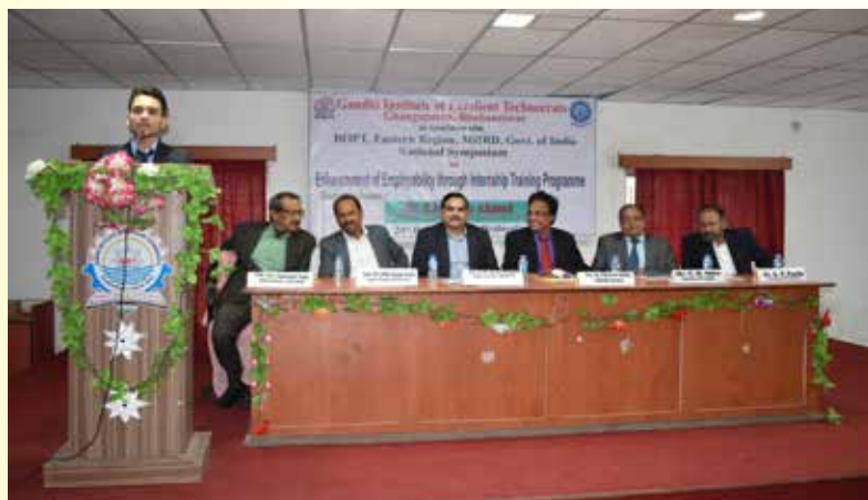
National Symposium on 'Enhancement of Employability through Internship Training Programme' at Bhubaneswar on 20 December 2017