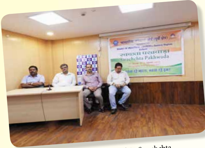
The officers of BOPT(ER) in Swachhta Pakhwada Programme