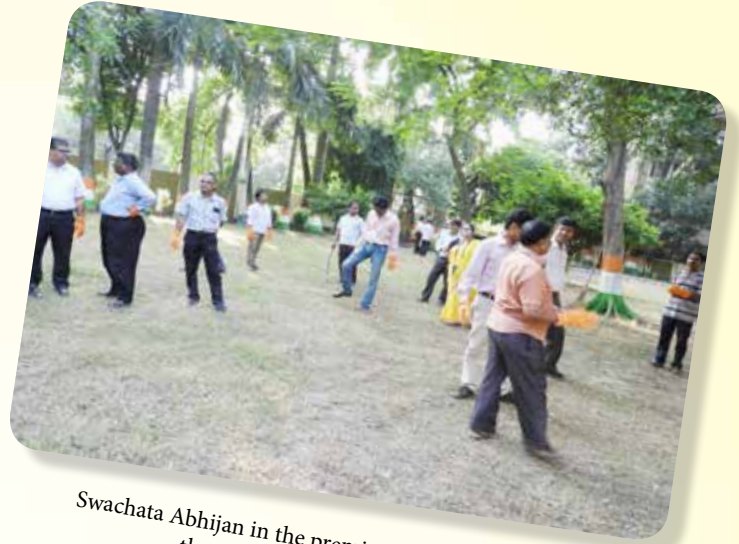
Swachata Abhijan in the premises of BOPT(ER) by the officers & staff members