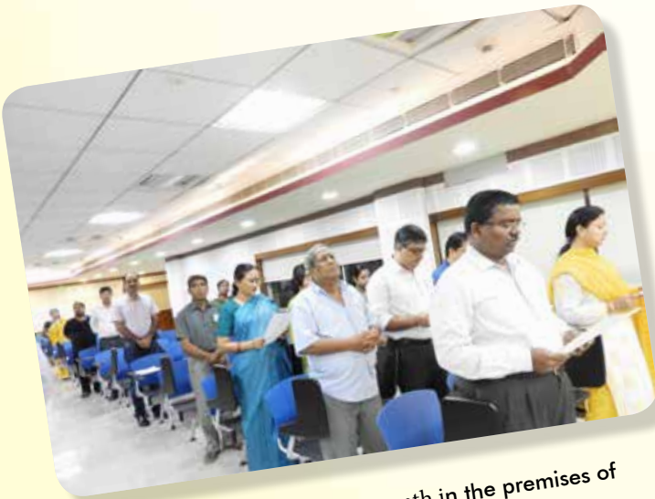
Quit India Movement saphath in the premises of BOPT(ER)