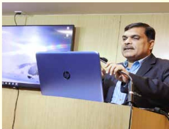
Welcome address by Director in Group meeting on Skill Assessment under NATS on 06 May, 2017