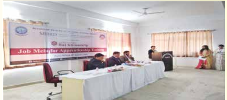
Director BOPT (ER) along with the participants at the Job Mela at Rai University, Jharkhand