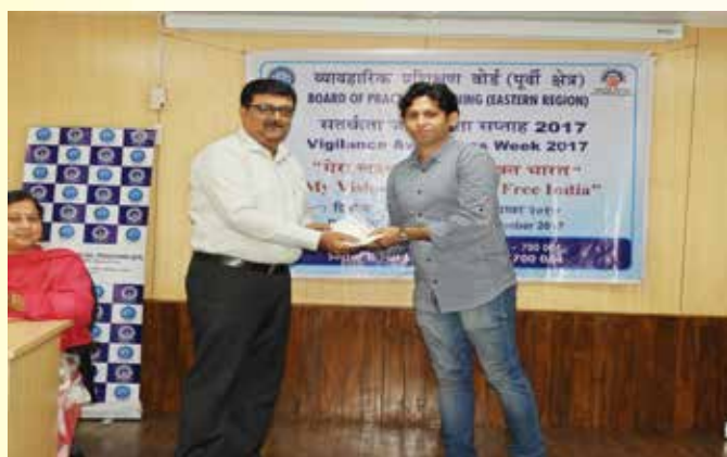
Prize distribution during Vigilance Awareness Week