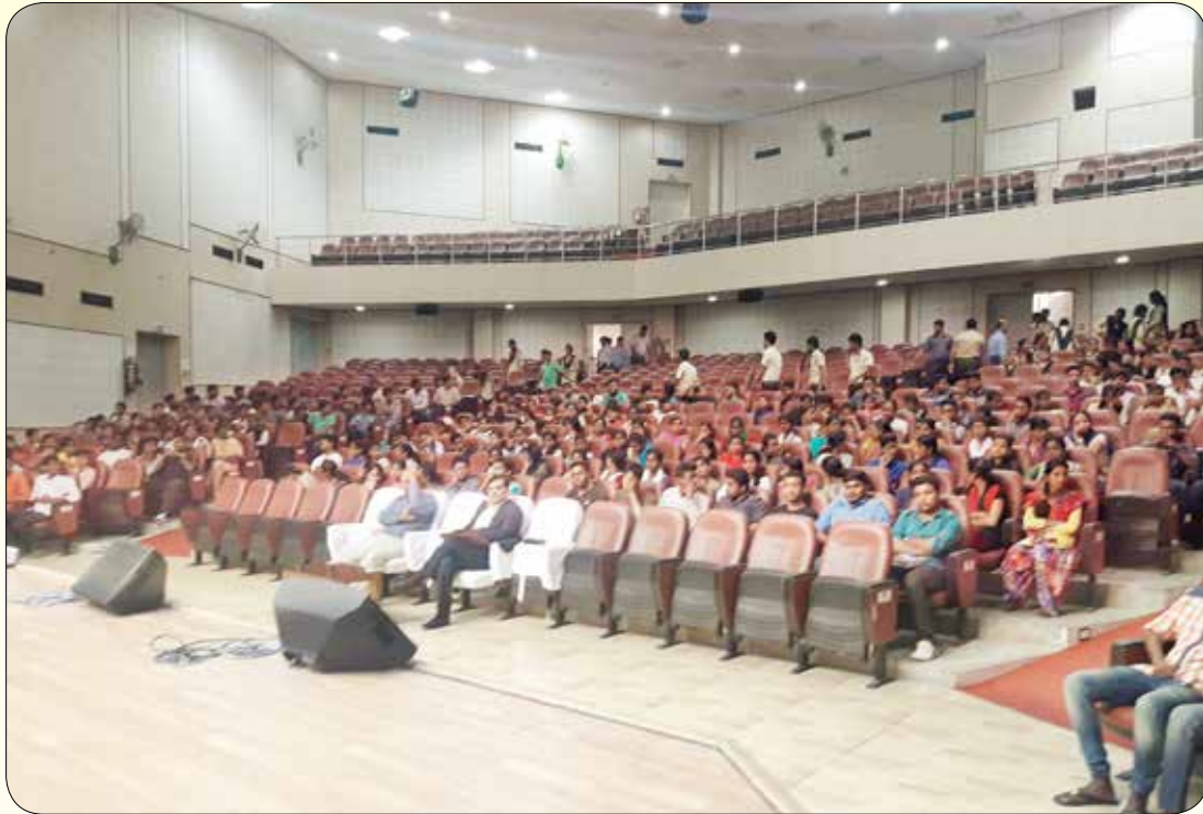
Students gathered at Dr. B. R. Ambedkar Institute of Technology for Exposure to NATS