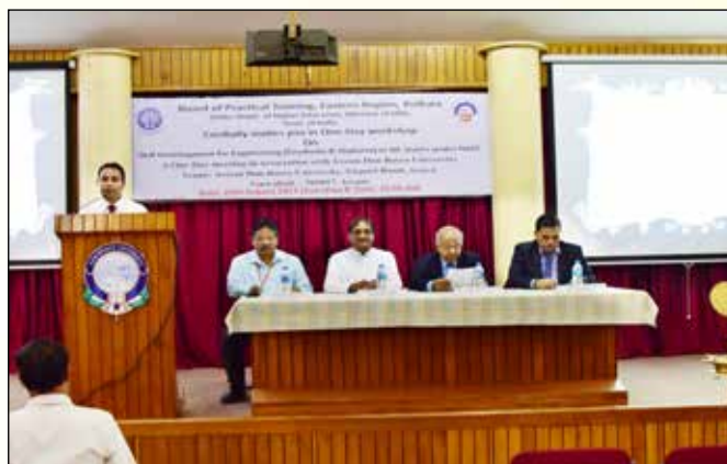
Deliverance in the workshop at Guwahati