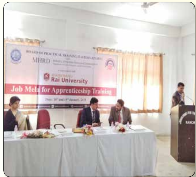
Job mela for Apprenticeship Training organised by Rai University