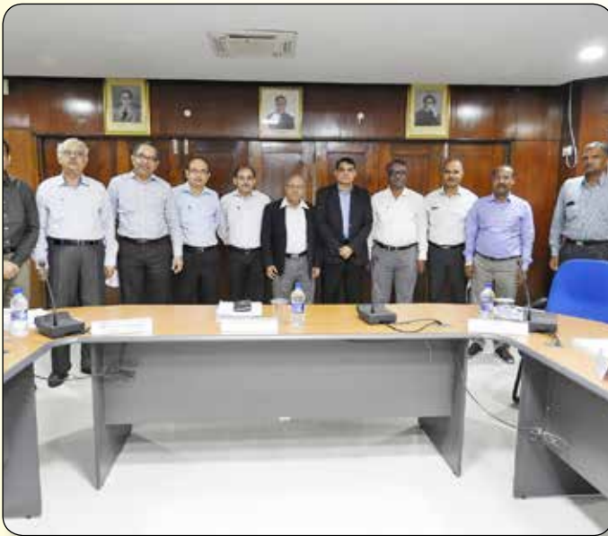
BOG Members of BOPT(ER), Kolkata

they relate to the training of Engineering Graduates (Degree Holders), Technician (Diploma Holder) pass outs in exercise of power conferred to the Board under the said act. Now, the Board has also been assigned with the responsibility of arranging Internship Programme in the Establishments/ Industries for the Technical Students.