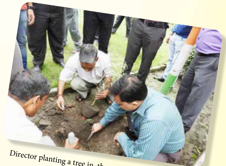
Director planting a tree in the premises of BOPT(ER)