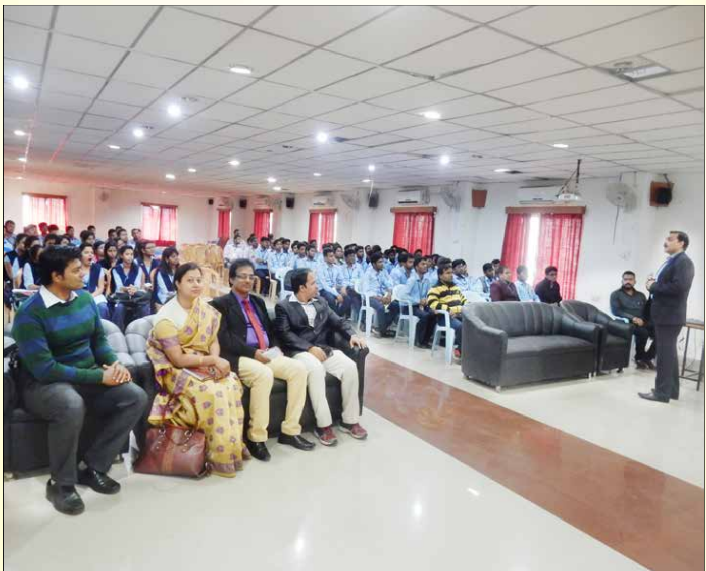
A view of the Audience in the group Meeting

Board of Practical Training (Eastern Region) in association with the Jharkhand Rai University organized a Job Mela Apprenticeship Training for B.E/ B.Tech & Diploma in Engineering and Technology Passed out students of the state on 18 & 19 January 2018 at Rai University Campus, Ranchi.