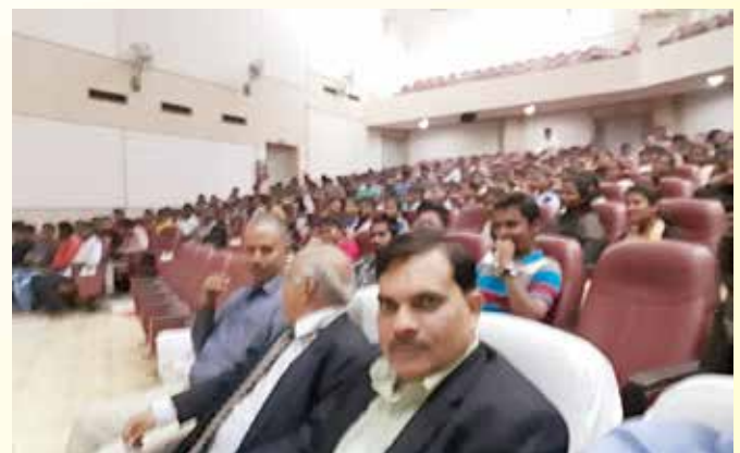
Director BOPT(ER) along with the participants at Dr. B.R. Ambedkar Institute of Technology, Port Blair