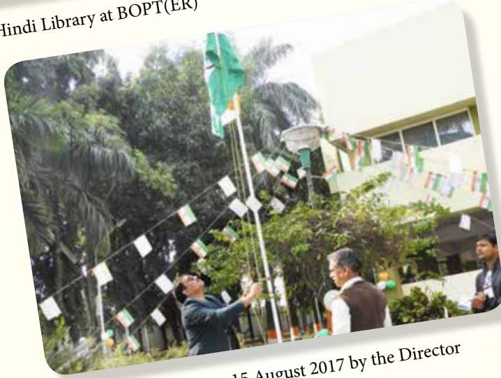
Hosting of Flag on 15 August 2017 by the Director