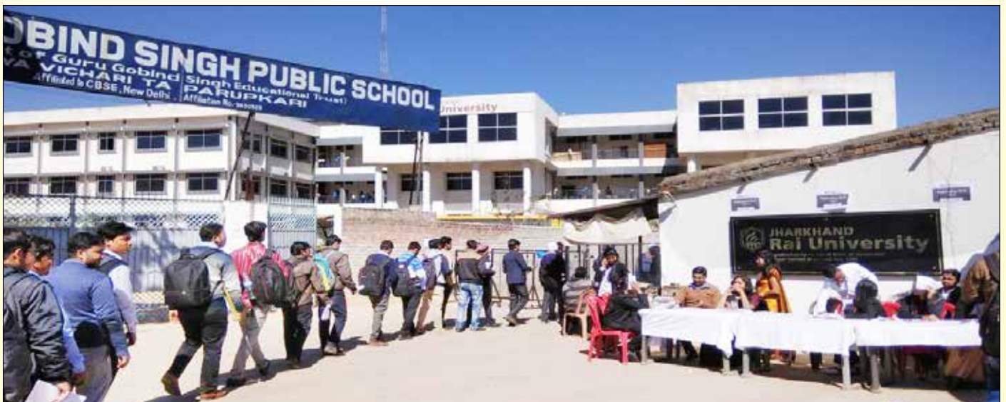
Students joining at Job Mela at Rai University, Jharkhand

It was conducted successfully to fill up more than 300 vacancies as Apprentices initially for one year in above said 27 Esteemed Establishments. More than 722 students from the state of Jharkhand and Bihar participated in the Job Mela.