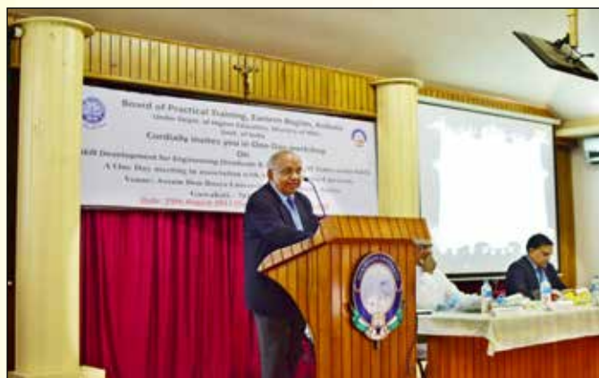
Chairman delivering his lecture in workshop at DonBosco University, Guwahati