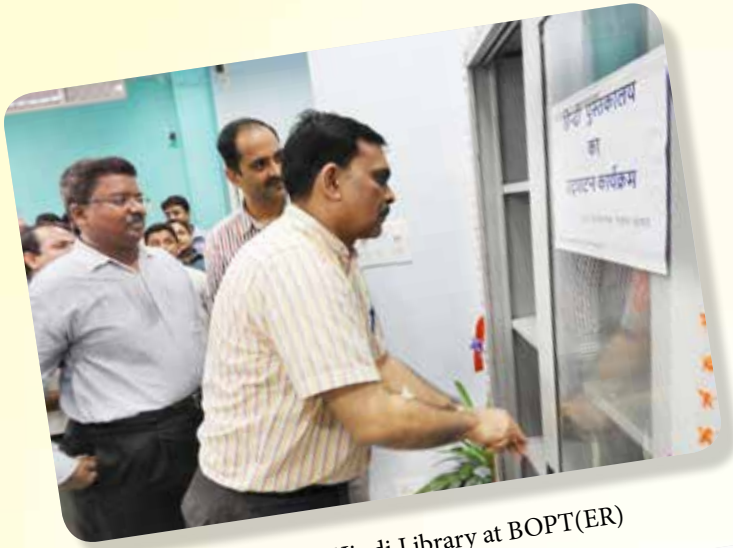
Inauguration of Hindi Library at BOPT(ER)