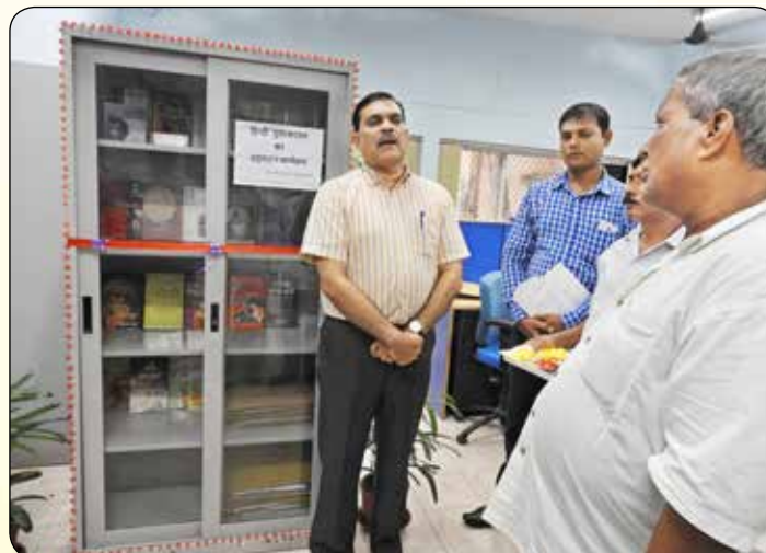
Inauguration of Hindi Library at BOPT(ER), Kolkata office