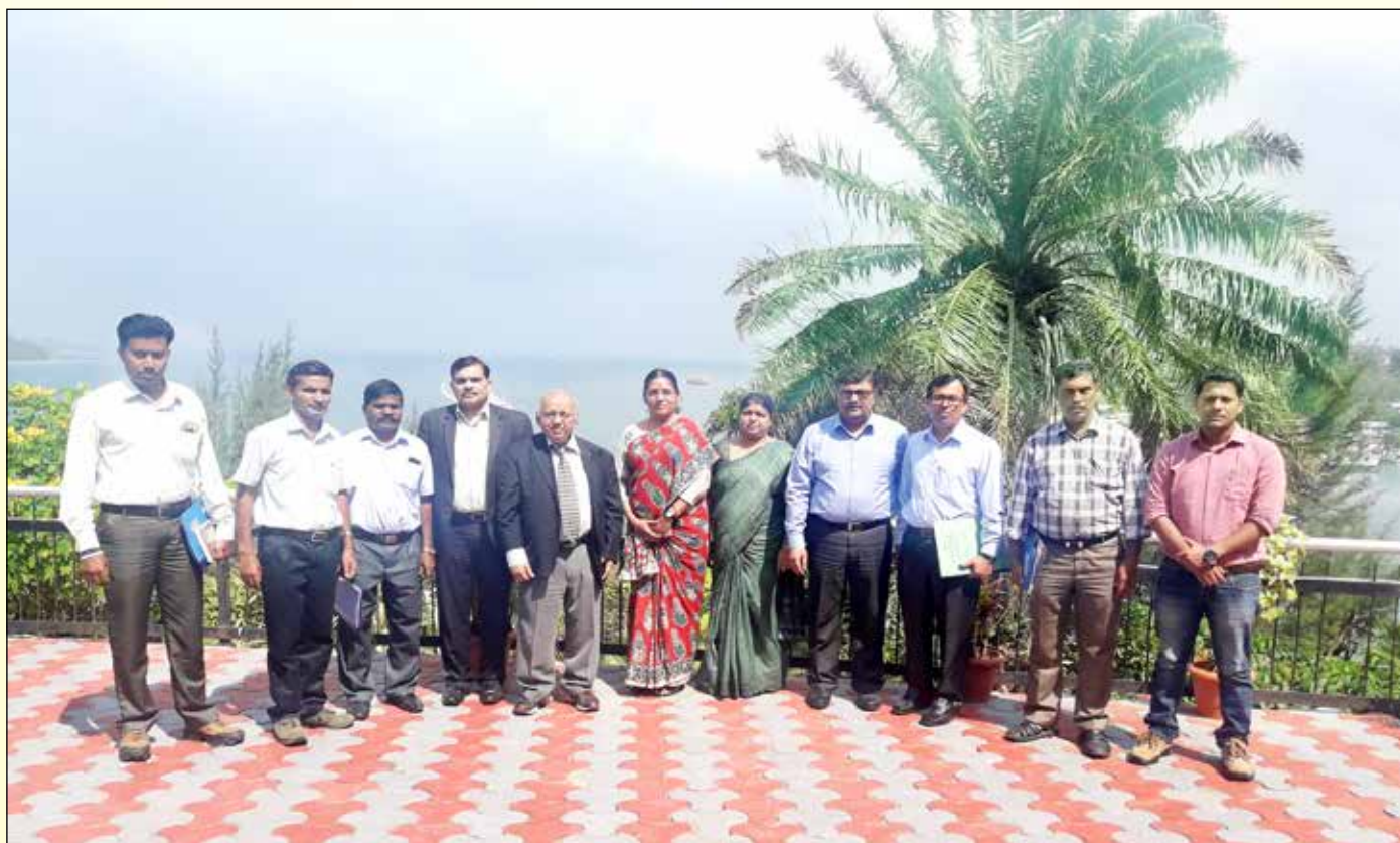
The participants along with the Chairman, Director, Officers of BOPT(ER) at Port Blair