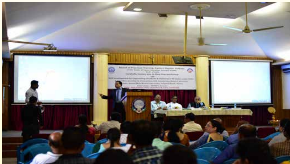
Interaction during the meeting on 'Skill Development for Engineering (Graduate & Diploma) in NE States under NATS' on 29 August 2017 at Assam Don Bosco University