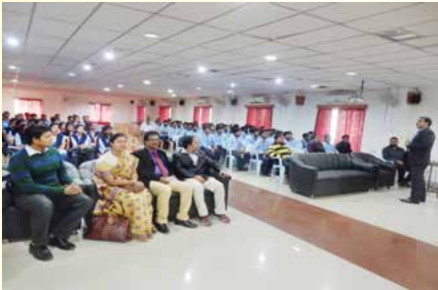
Internship Training on Dec 20, 2017 at BBSR

The Institutes are one of the major stakeholders of Apprenticeship Training Scheme of Govt. of India. This Board also interact with the Principal and Training-cum-Placement Officers of various engineering and diploma colleges throughout the year at different venues and all such programmes are named as Principal/TPOs meet. The Principals & TPOs of all such institutes are invited at one place and deliberations and subsequent discussions are also made to evolve suitable outcome on the points as per the agenda. Mainly these type of programmes are organized as a part of awareness and publicity measure of the Apprenticeship Training Scheme of Govt. of India.