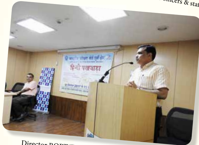
Director BOPT(ER) delivering address at Hindi Pakhwara Programme