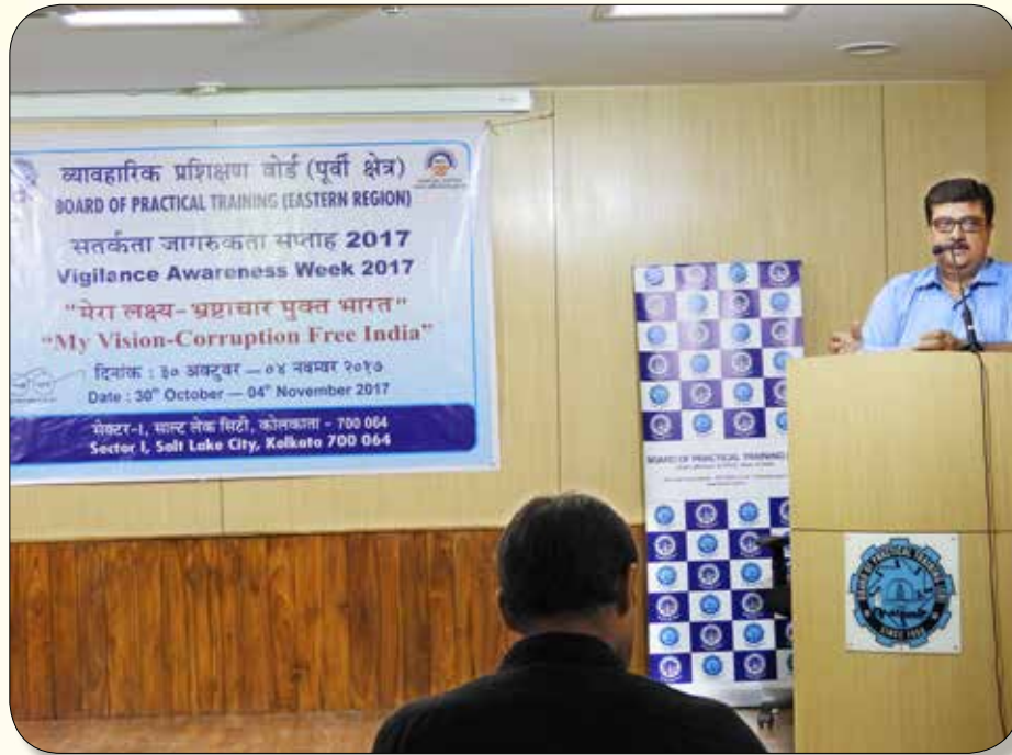
Observation of Vigilance Awareness Week

To facilitate the fresh graduates & diploma holders in engineering / technology for acquiring practical training in industries / organisations and thus to make them more employable.