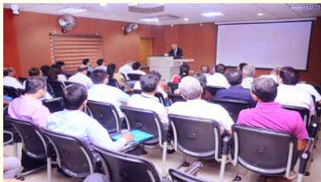
Participants at the meeting at Patna Extension Centre

Kolkata and inaugurating Patna Extension Centre in the Campus of NIT, Patna. He mentioned that with the extension centre at NIT, Patna, the students of