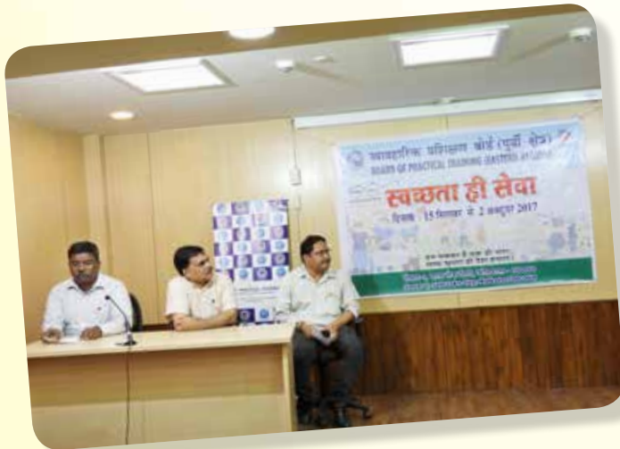
Director along with the Officers in Programme on Swachhta