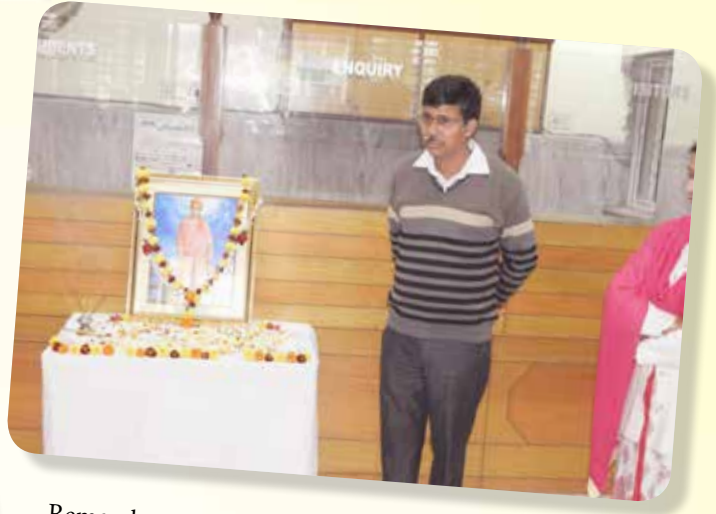
Remembering Swami Vivekanda on His Anniversary