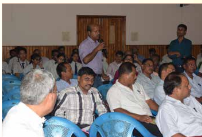
A Participant expressing his views in a Group Meeting at Guwahati on 29 August 2017

that after completion of training he/she should feel a development in his/her skill and knowledge. d) To identify industry's expectations from the engineers and technicians etc.