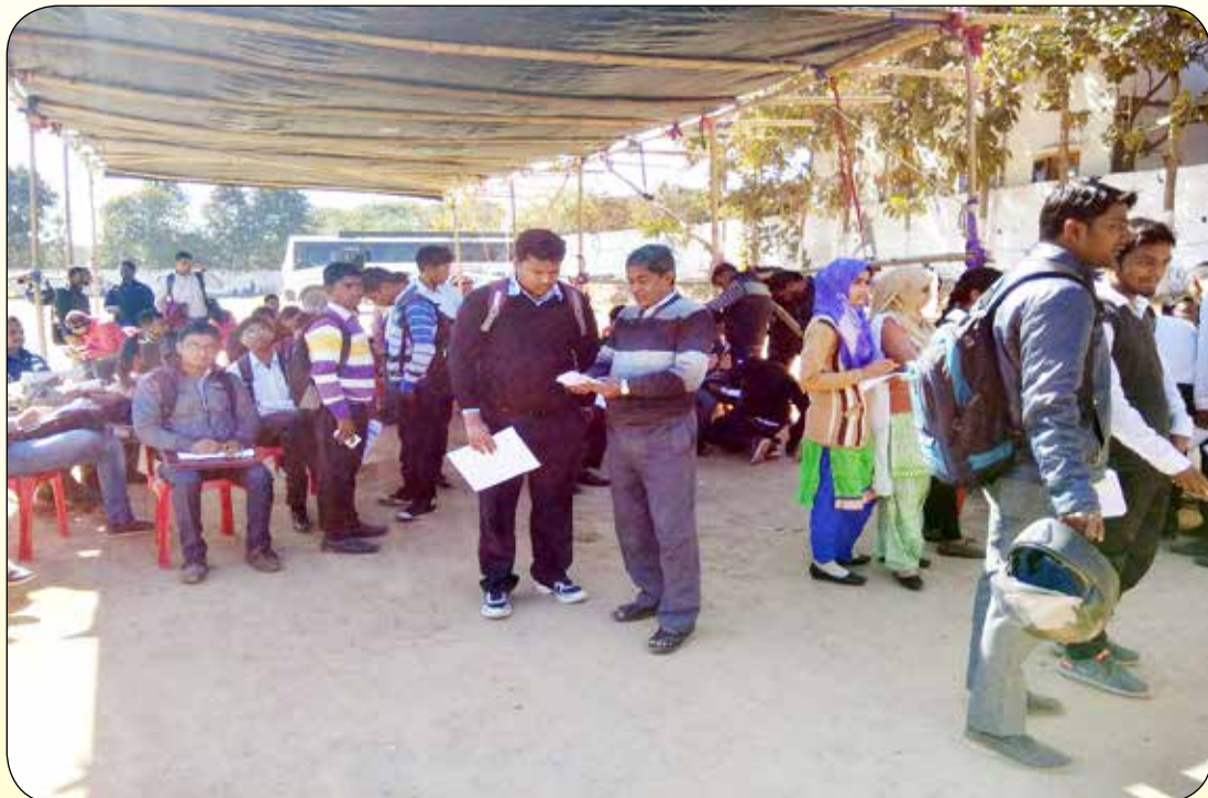
Students for Apprenticeship Training in Job Mela at Ranchi