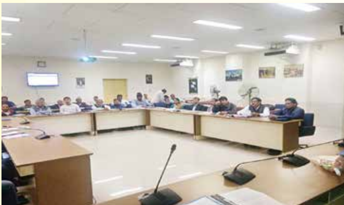
Group Meeting at BCCL