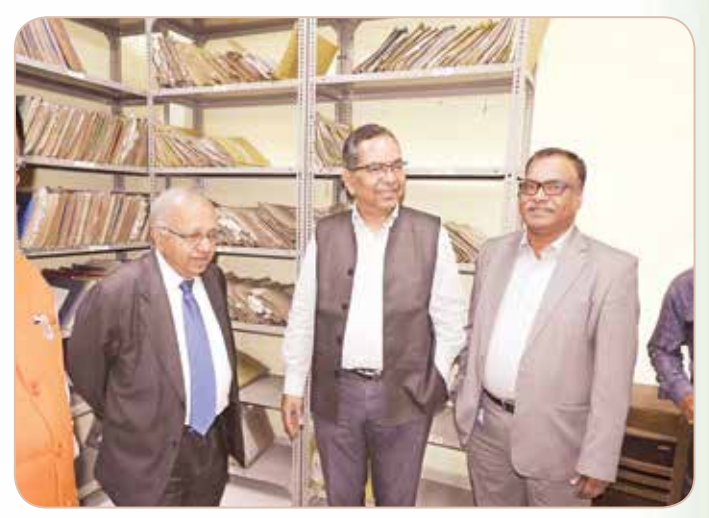
Chairman, BOPT (ER) along with other Board members at Record Room

d) To identify industry's expectations from the engineers and technicians.