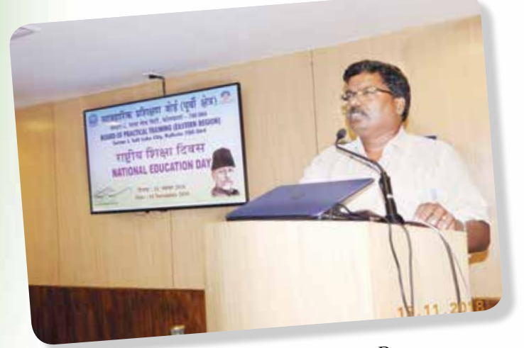
Observance of National Education Day