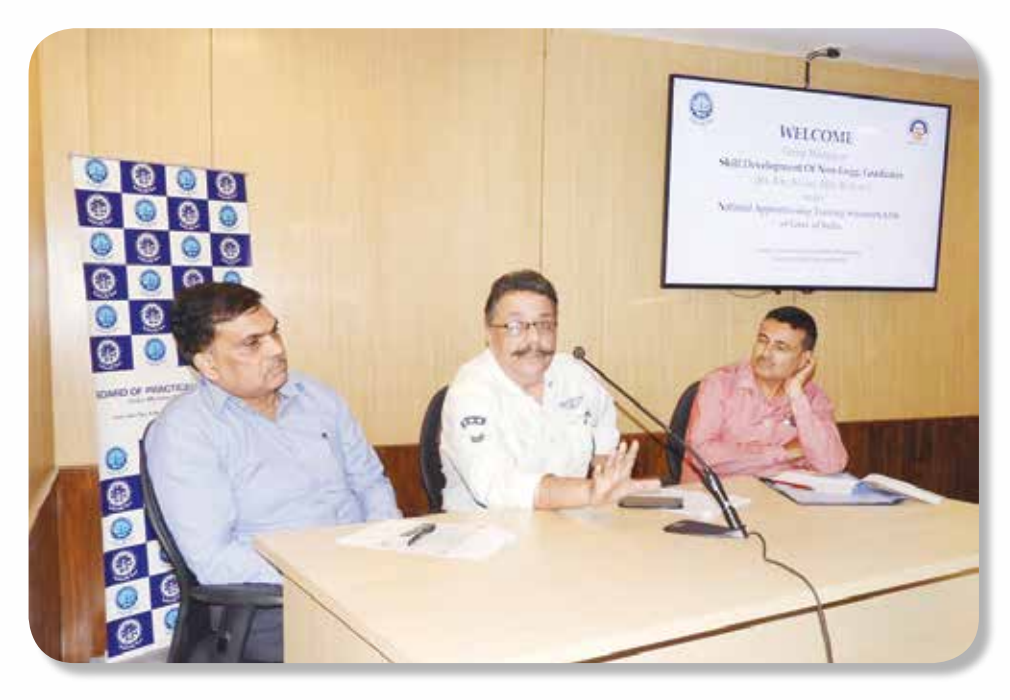
Programme on Skill Development of Non-engineering Graduates