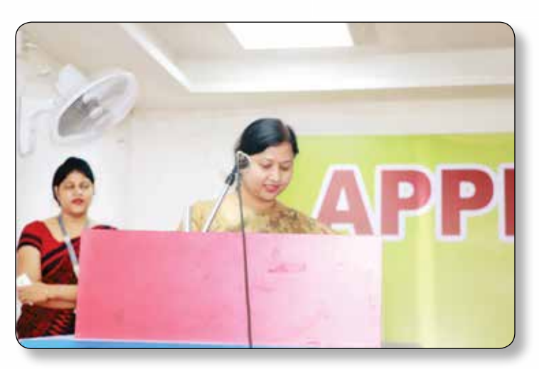
Job Mela at Jajpur on 29 August 2018