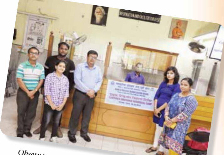
Observance of Customer Grievance Redressal Camp during Vigilance Awareness Week