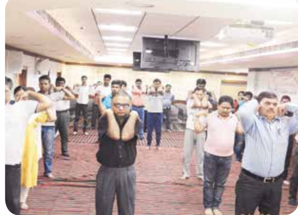
Yoga performed by Staff of BOPT(ER) during International Day of Yoga 2018