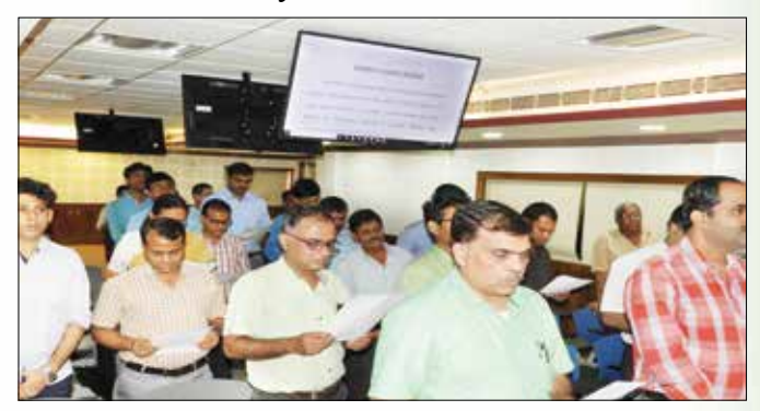
Pledge taking ceremony during observance of Sadbhavana Diwas

The lecturers should be from the premier and leading institutes so that the certificate issued finally on successful completion of the course would have due weightage during employment in the industry.