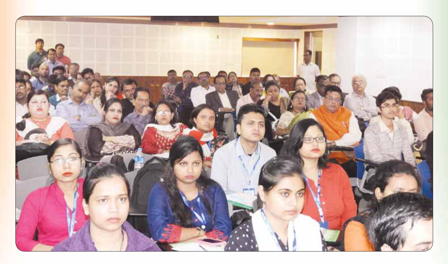
Inauguration of GADP on 6 February 2019 at BOPT(ER), Kolkata