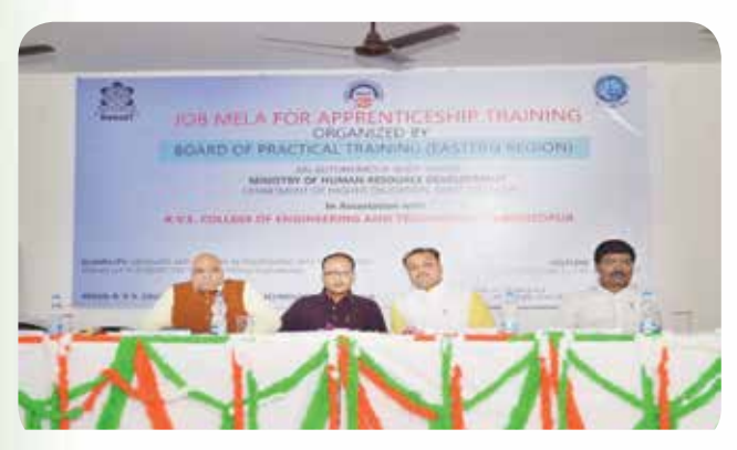
Job Mela in Jamshedpur on 11 & 12 October 2018

The Institutes are one of the major stakeholders of Apprenticeship Training Scheme of Govt. of India. This Board also interact with the Principal and Training-cum-Placement Officers of various engineering and diploma colleges throughout the year at different venues and all such programmes are named as Principal/ TPOs meet. The Principals & TPOs of all such institutes are invited at one place and deliberations and subsequent discussions are also made to evolve suitable outcome on the points as per the agenda. Mainly these type of programmes are organized as a part of awareness and publicity measure of the Apprenticeship Training Scheme.