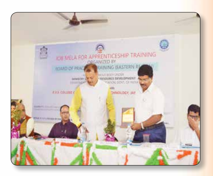
Job Mela at Jamshedpur on 11 & 12 October 2018

outs in exercise of power conferred to the Board under the said act. Now, the Board has also been assigned with the responsibility of arranging Internship Programme in the Establishments/ Industries for the Technical Students. Furthermore, BOPT(ER) has also launched General Attribute Development Programme (GADP) to impart soft skill attributes to the apprentices, passed out students and fresh executives / non-executives.