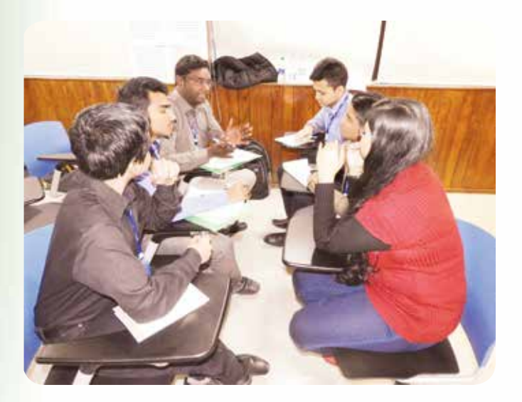
Group Discussion in GADP

and aspirant candidates and is gaining popularity day by day. To run this programme, the faculties are being drawn from different fields of academicia and industries in collaboration of Unicorn Consultants. The most important feature of this programme is that it is not merely confined into long classroom lectures but an admixture of games, group discussions, presentation of relevant video clips, role-play and all other innovative techniques. The assessment of the participants undergoing GADP consists of faculty observation, group discussion and interview by the experts of the industries. To have a meaningful outcome of this programme, a Certificate of Proficiency (CoP) with Grade is also been given to the participants who complete the entire programme. This is a continuous 5 days programme (8 hours per day) amounting to a total of 40 hours of thorough and innovative modules.