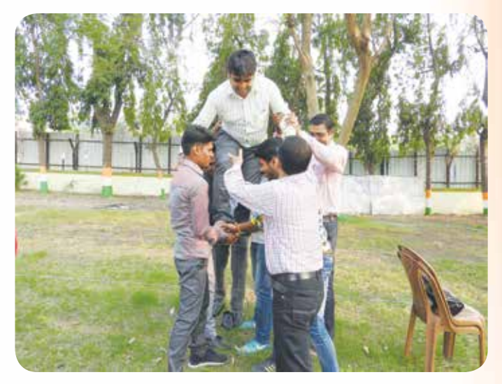
Role play in GADP