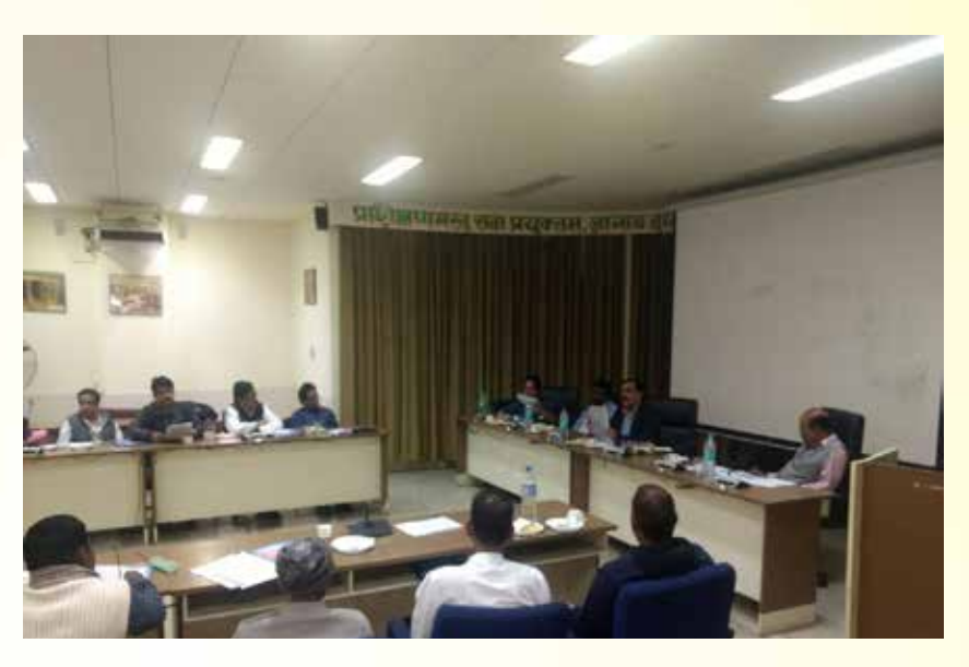
Group Meeting at BCCL on 15 December 2017

'Industries Meet' programme organized by BOPT(ER) Kolkata is a very important event all throughout the year. The basic objective of such meet is to harp on the issues related to apprenticeship training, maintenance of records & returns of such training as well as to monitor the quality of the training. These meets are required to understand the difficulties faced by the industries and the students and to further improve the training seats as well as the quality of training.