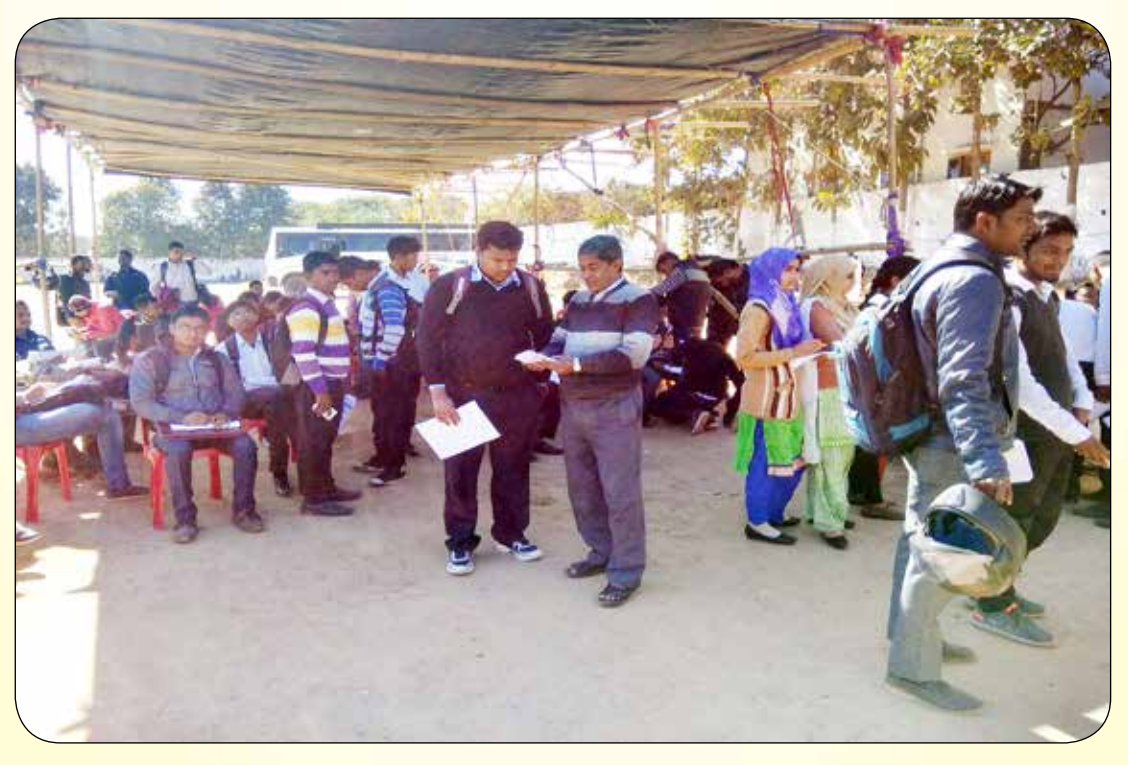
Students for Apprenticeship Training in Job Mela at Ranchi