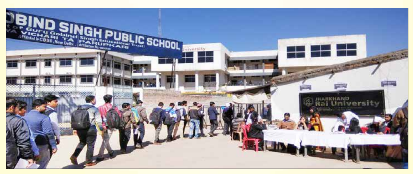
Students joining at Job Mela at Rai University, Jharkhand

It was conducted successfully to fill up more than 300 vacancies as Apprentices initially for one year in above said 27 Esteemed Establishments. More than 722 students from the state of Jharkhand and Bihar participated in the Job Mela.