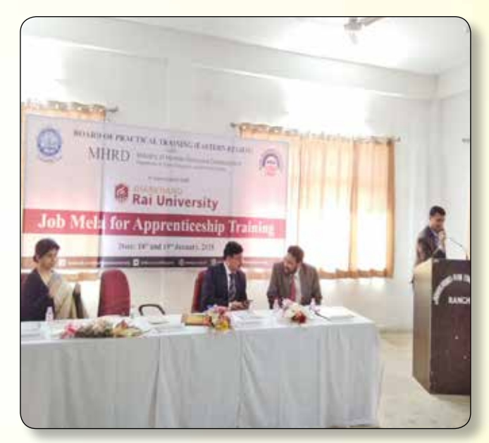
Job mela for Apprenticeship Training organised by Rai University