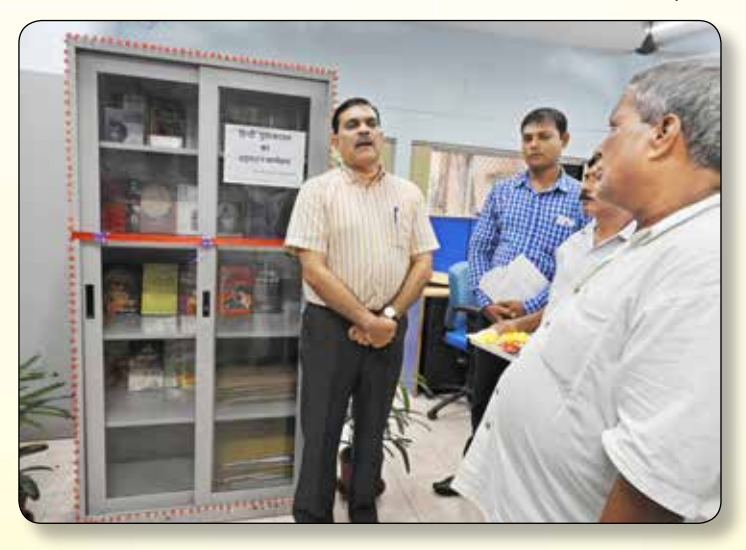
Inauguration of Hindi Library at BOPT(ER), Kolkata office