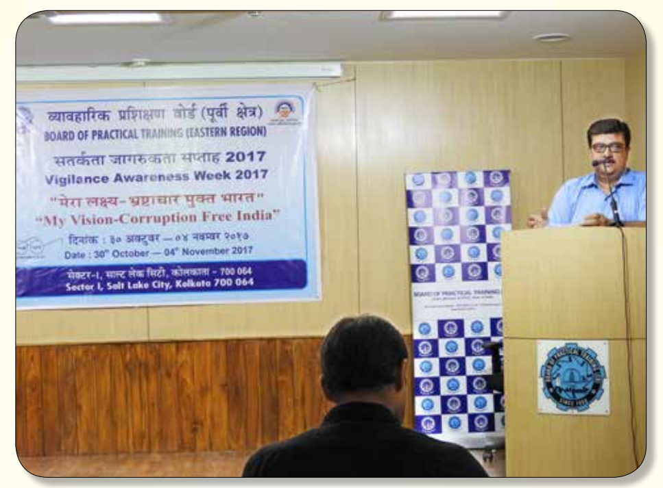
Observation of Vigilance Awareness Week

o facilitate the fresh graduates & diploma holders in engineering / technology for acquiring practical training in industries / organisations and thus to make them more employable.