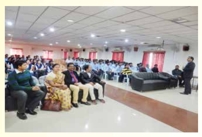
Internship Training on Dec 20, 2017 at BBSR