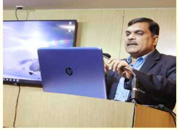
Welcome address by Director in Group meeting on Skill Assessment under NATS on 06 May, 2017

National Symposium on 'Enhancement of Employability through Internship Training Programme' at Bhubaneswar on 20 December 2017