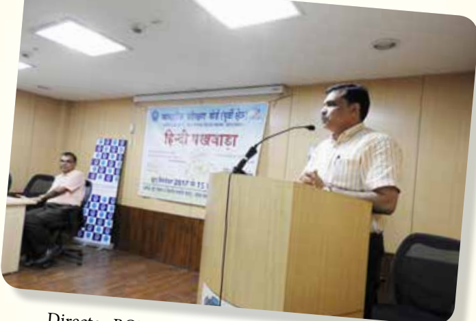
Director BOPT(ER) delivering address at Hindi Pa-khwara Programme