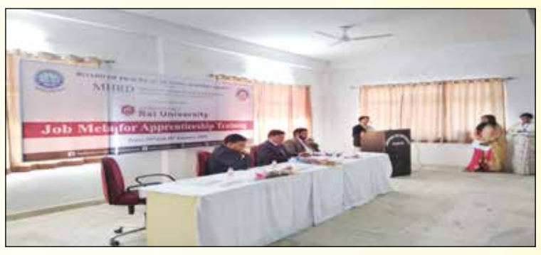
Director BOPT (ER) along with the participants at the Job Mela at Rai University, Jharkand

1. Aegis Customer Services Pvt. Ltd. 2. Bharat Coking Coal Limited (BCCL) 3. Bokaro Steel Plant 4. Central Coalfields Limited (CCL) 5. Culture CoLab Pvt. Ltd., 6. Fleetguard Filters Pvt. Ltd., 7. GE Diesel Locomotive Pvt. Ltd., 8. Heavy Engineering Corporation Limited (HEC) 9. Highco Engg. Company Ltd., 10. ICAR Ranchi, 11. Infinite Net Solutions, 12. Jamshedpur Continuous Annaling and Processing Company Pvt. Ltd., (JCAPCPL), 13. JMT AUTO LIMITED, 14. JOST India Auto Component Pvt. Ltd, 15. Jumbo Engg. Pvt. Ltd., 16. Mecon